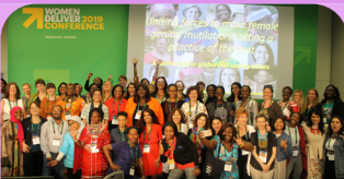
Women Deliver Conference 2023